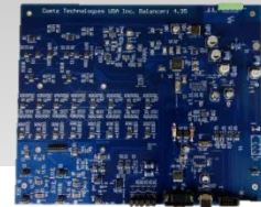
Accurate & High Quality Electronics

Our Vertical Balancing Machines are designed for optimum performance and durability. Several options are available depending on the customers requirement such a on board drilling and milling, pneumatic clamping, manual, semi-auto or fully auto cycles and even robotic loading and unloading. Our full featured software includes ISO1940 tolerance calculator, milling or drilling indication, Add/Remove, Tooling Zero, Tooling Compensation and many more features.