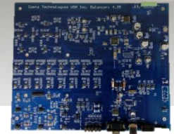
Accurate & High Quality Electronics

Our Vertical Balancing Machines are designed for optimum performance and durability. Several options are available depending on the customers requirement such a on board drilling and milling, pneumatic clamping, manual, semi-auto or fully auto cycles and even robotic loading and unloading. Our full featured software includes ISO1940 tolerance calculator, milling or drilling indication, Add/Remove, Tooling Zero, Tooling Compensation and many more features.