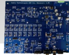
Accurate & High Quality Electronics

Our Vertical Balancing Machines are designed for optimum performance and durability. Several options are available depending on the customers requirement such a on board drilling and milling, pneumatic clamping, manual, semi-auto or fully auto cycles and even robotic loading and unloading. Our full featured software includes ISO1940 tolerance calculator, milling or drilling indication, Add/Remove, Tooling Zero, Tooling Compensation and many more features.